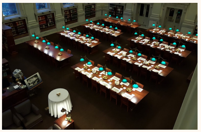
READING ROOM LIBRARY